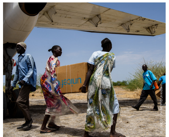
South Sudan: Porters unload boxes of supplies during a Rapid Response Mission in the village of Aburoc.

To help UNICEF meet the changing needs of the world's children, please remember us by leaving a lasting legacy in your Will.