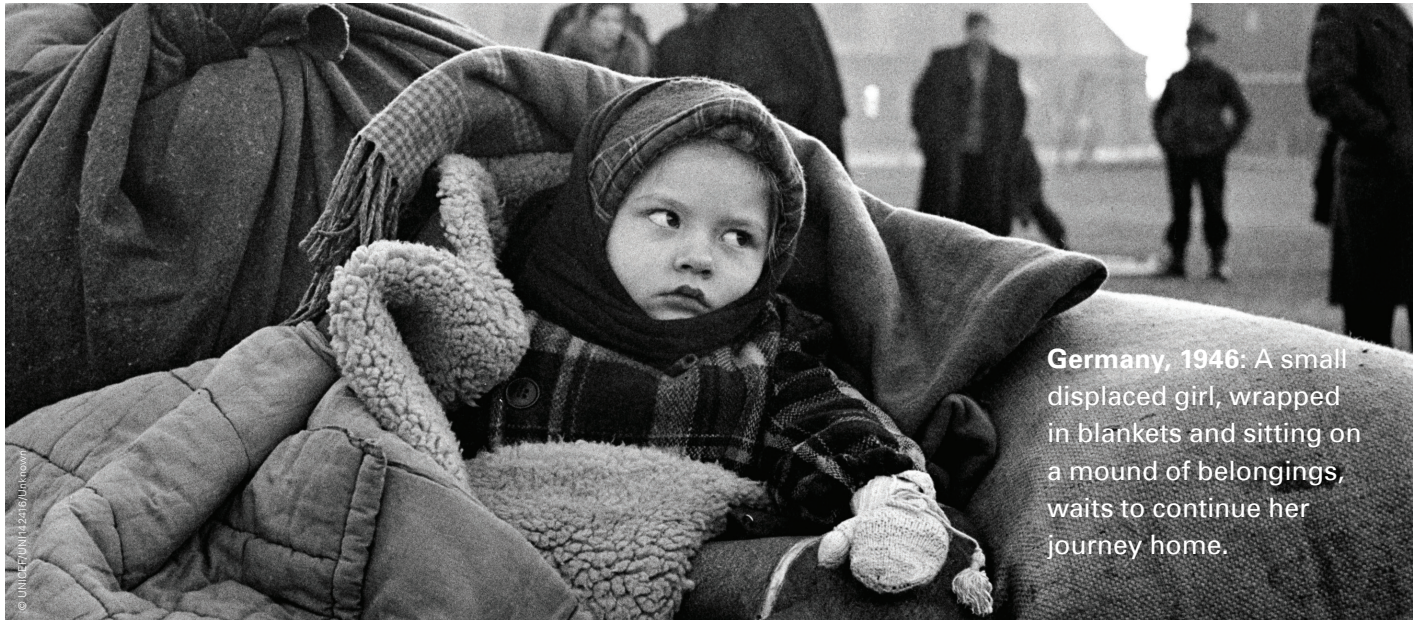
Germany, 1946: A small displaced girl, wrapped in blankets and sitting on a mound of belongings, waits to continue her journey home.